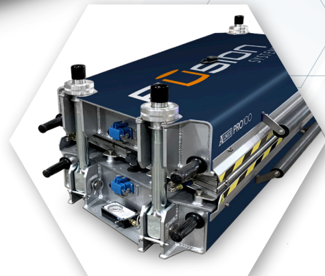
(▲ PRO100 Series shown with custom wrap applied)